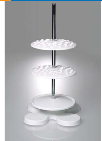
896303-0090 frame for pipettes with two rotating perforated plates and drip pan.