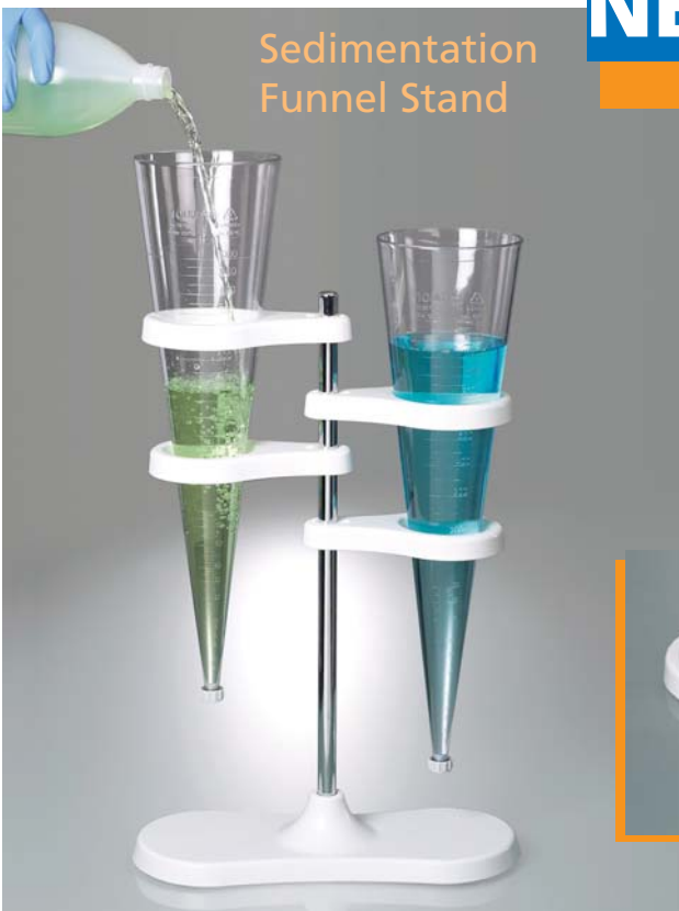
Sedimentation Funnel Stand