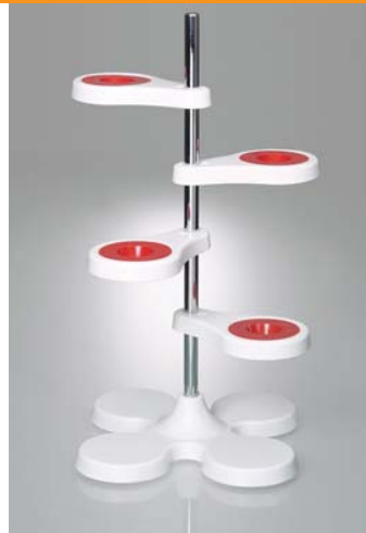
896223-0400 Funnel stand with four funnel holders and four reducing inserts. A very sturdy pedestal provides a storage area for four containers and ensures absolute safety against overturning.