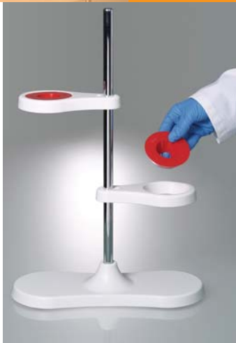
896223-0200 Funnel stand with two funnel holders and two reducing inserts. Space-saving design with two practical storage areas.